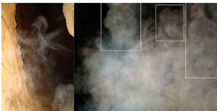
Entities photographed in plasma layers of ether

under the form of chains of matter or atoms, but flesh, blood and bones, only keep a very