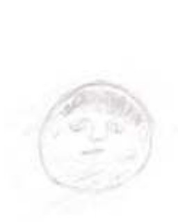
The Amasutum (on the left) - Eck (on the right)