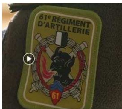
The effigy of the demon Enlil / Set on a crest of the 61 st Artillery Regiment

In reality, this hero would personify a group of hyper-dimensional entities of the Service to the Self, that is to say humans of our planet who now inhabit the intraearts - one of the realities which in the past was densified on its surface and which currently, would still be managed by extraterrestrials of 4th density and psychic entities of 6th density from Orion. The Sumerians already knew them in their time under the name of Anunnaki, reptilian entities « disciples of Enlil / Set ».