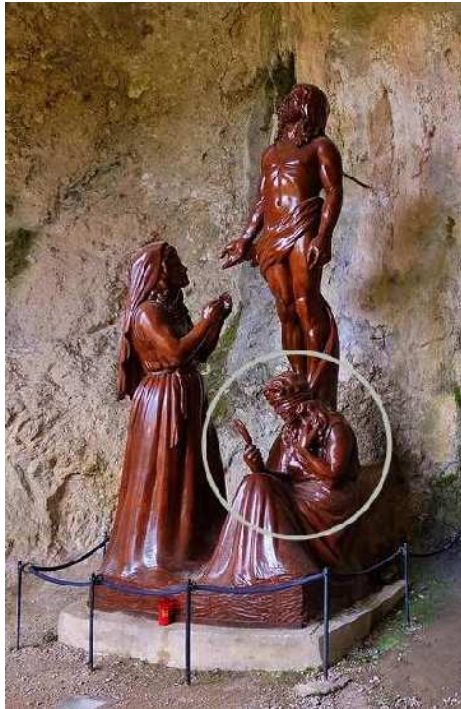
At the foot of the “ascending Christ”, Mary Magdalene, blindfolded, but with her psychic mirror, contemplates her Self (or inner Self)! Wood carving, hermitage of Galamus (Aude region)

The consequences of the quantum mirror phenomenon – sometimes more or less illustrated in some tales such as those of Lewis Carroll, “Alice in Wonderland”, “Through the Looking-Glass”, or the film “The Chronicles of Narnia” adapted from the work of C. S. Lewis – are sorts of initiations to understand the parallel realities, which should be studied, developed, then handled with a lot of tact and caution.