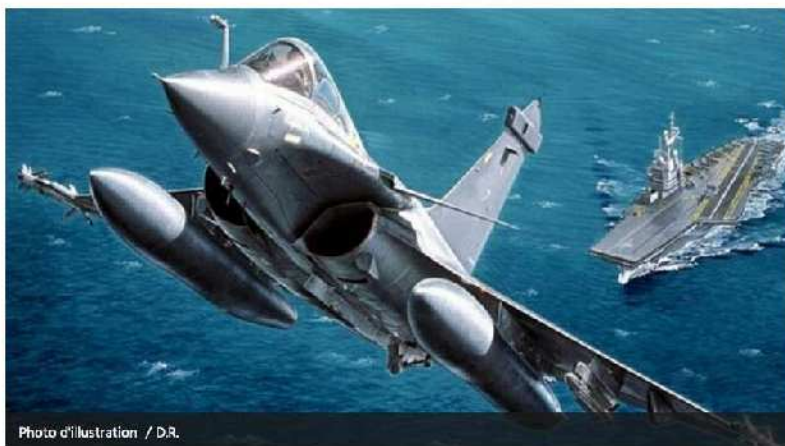
Photo d'illustration