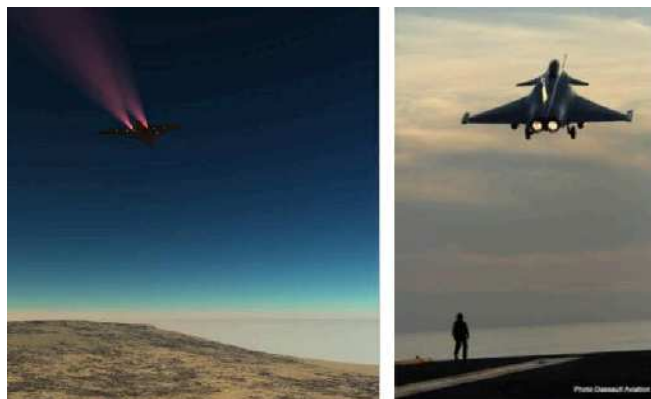
Image on the left: The Geghu, Enki’s “hammering Falcon” On the right: the French army’s Rafale

Shocked and shaking with astonishment, I then shouted: “If only these damn planes could one day disappear!”