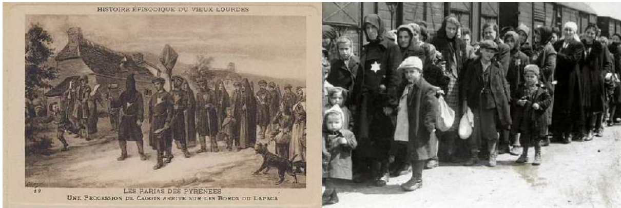
A procession of Cagots “Parias of the Pyrenees” wearing the clothing marked with a palmiped foot