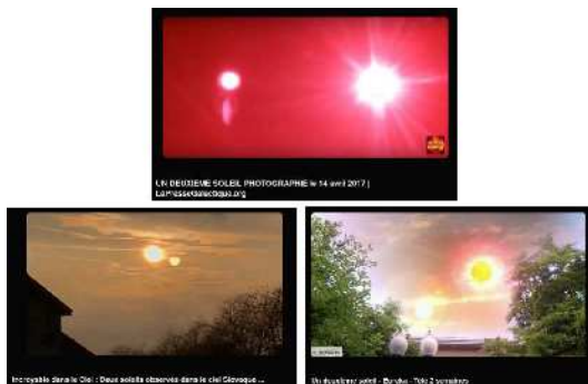
A second sun photographed on April 14 th , 2017

No! They are sometimes atmospheric reflections, but most often they are images retouched using software, since a brown dwarf only emits a low infrared radiation, thus no visible light. It therefore remains imperceptible to human eyes.